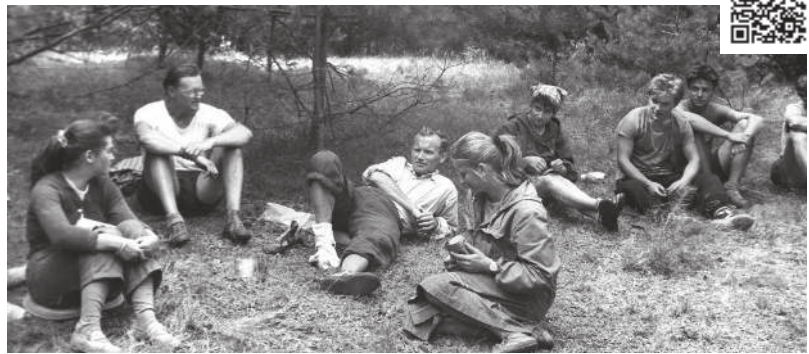
View this bulletin online at www.DiscoverMass.com